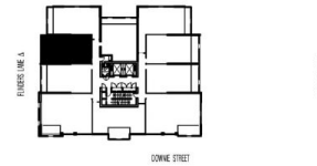
APARTMENT TYPE 'K2' LOCATION